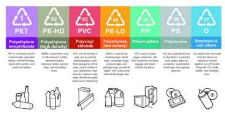
No copyright infringement is intended

Only plastic, metal, and aluminum containers will be accepted for curbside recycling. Our recycling material is processed by the City of Columbia which uses a <u>dual-stream system</u> for containers and fiber on separate lines. Our trash contractor, Dayne's Waste, doesn't have collection vehicles to pick up recycling material separated for the dual-stream system. Therefore, paper, cardboard, and other fiber material will no longer be accepted in curbside recycling starting January 17, 2020.